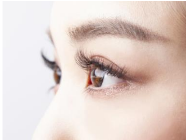
parisienne lash lift