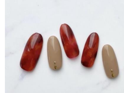
hand 60min art

Water and impact-resistant gel which the salon invented enables nails to remain beautiful for long time.