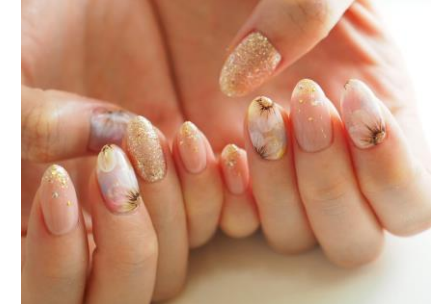
hand 90min art